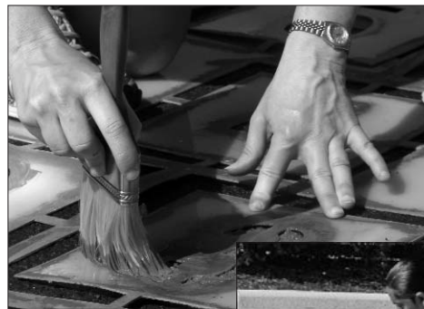
Captain Yuri Harrington and Karen Blickley work on a hopscotch pattern.

Thanks to Leadership Columbus volunteers, The Salvation Army's East Main Street location is home to a new "portable playground." The parking lot at the East Main building has enough room for children to play outside, but with cars moving through, it hasn't been a safe area. In addition, enough equipment for all the children in many age ranges was too expensive, and in danger of being stolen if left outdoors. Leadership Columbus, one of the top five ranked community leadership programs in the country, provides state of the art education and training for emerging and existing leaders in the Columbus area. This year's leadership class chose The Salvation Army as one of its group projects, and have coordinated and funded the playground project.